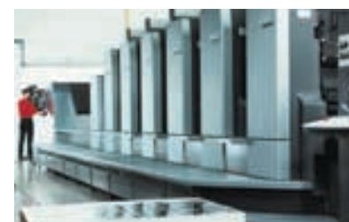
Checkpoint utilizes the latest printing technologies and processes to produce the highest-quality custom documents. Whether it's offset, flexo, or for a laser or thermal printer, we can provide any printing solution to meet your needs.

Checkpoint's diversified product line helps customers identify, track and secure assets throughout the supply chain, resulting in streamlined operations and increased profits.