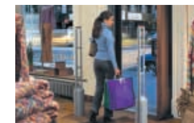
Our paper-thin RF labels can be embedded seamlessly into your custom tags for superior product security. And these RF-integrated tags work hand-in-hand with our wide range of RF-EAS hardware solutions to deter theft and protect your inventory against loss.

Checkpoint Systems, Inc. 101 Wolf Drive, P.O. Box 188 Thorofare, NJ 08086 800 257 5540 Toll Free 856 848 1800 Phone 856 848 0937 Fax www.checkpointsystems.com