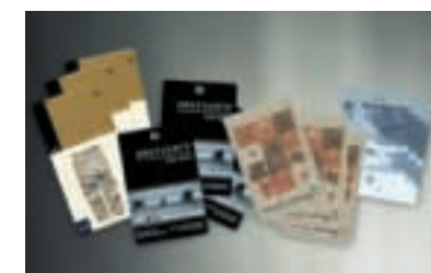
Our solutions include vibrant, full-color tags and labels to identify and track your products. Choose from a huge selection of tag materials and finishing options. And, we'll help you design a tag that will complement your brand image at the lowest possible price.